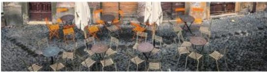
Sunday 29 th October @10:30am